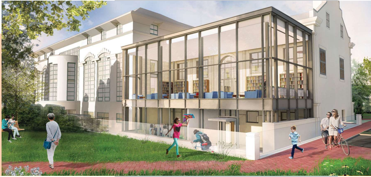
ROBBINS LIBRARY ADDITION (preliminary design rendering)

"The best thing about the Robbins Library.... The architecture. The friendly staff. The chance encounters. The willingness of librarians to keep up with the times and bridge the vast distance from Alexandria to Arlington and all the great and small library collections in between." - Library User comment from the Reimagining Our Libraries Survey