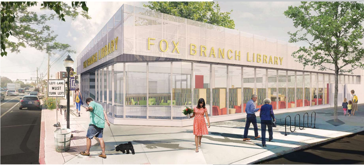
FOX BRANCH LIBRARY NEW BUILDING (preliminary design rendering)

Many of our visitors are also donors who love supporting the library. We are proud of the resources and programs we're able to offer, yet we're always looking for ways to do better. The generosity of this community helps fuel innovation and keeps our collections current. And on the horizon, we're so excited to see the 'Reimagining Our Libraries' project start to take shape. Now when I look at library spaces, I see them with an overlay of renderings: a vibrant new Fox Branch, accessible to all; a Robbins Library with dedicated story-time space, new group study rooms, laptop bars overlooking the beautiful gardens, more room for youth services, public restrooms on upper floors--all for the good of current and future generations. My sincere thanks to the Foundation, and to all of you, dear readers! - ANDREA NICOLAY, Director of Libraries